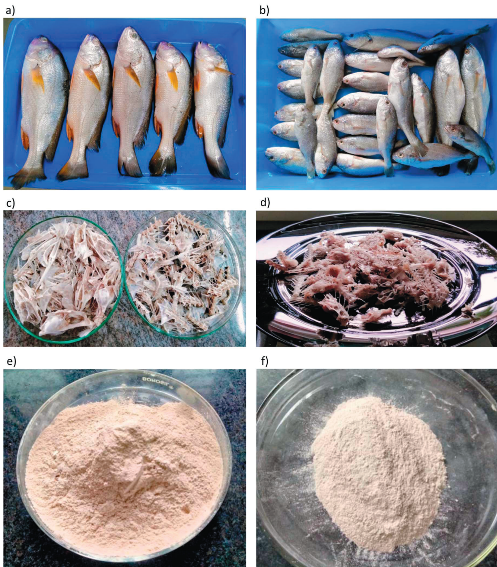
Fig. S2. Images show: a and b) fresh fish, c and d) dried fish bones and e and f) nano-calcium of Daysciaena albida and Otolithes ruber , respectively